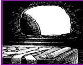
Write what Jesus tells the disciples next