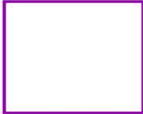
Draw Jesus suffering on the cross