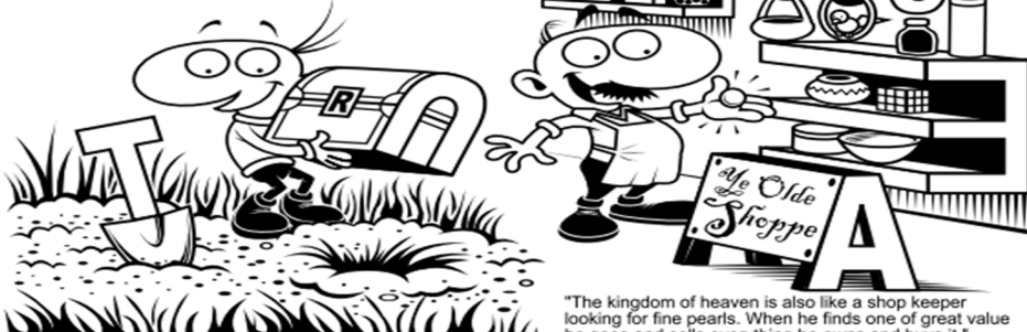
"The kingdom of heaven is also like a shop keeper looking for fine pearls. When he finds one of great value"

"The kingdom of heaven is like treasure hidden in a field which someone has found; he hides it again, goes off happy, sells everything he owns and buys the field."